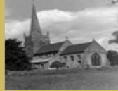
All Saints', Ladbroke