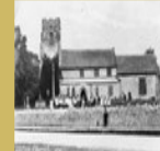
St Michael & All Angels, Ufton