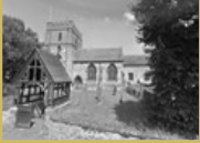
All Saints', Harbury