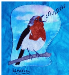
Detail from Quilt of Hope